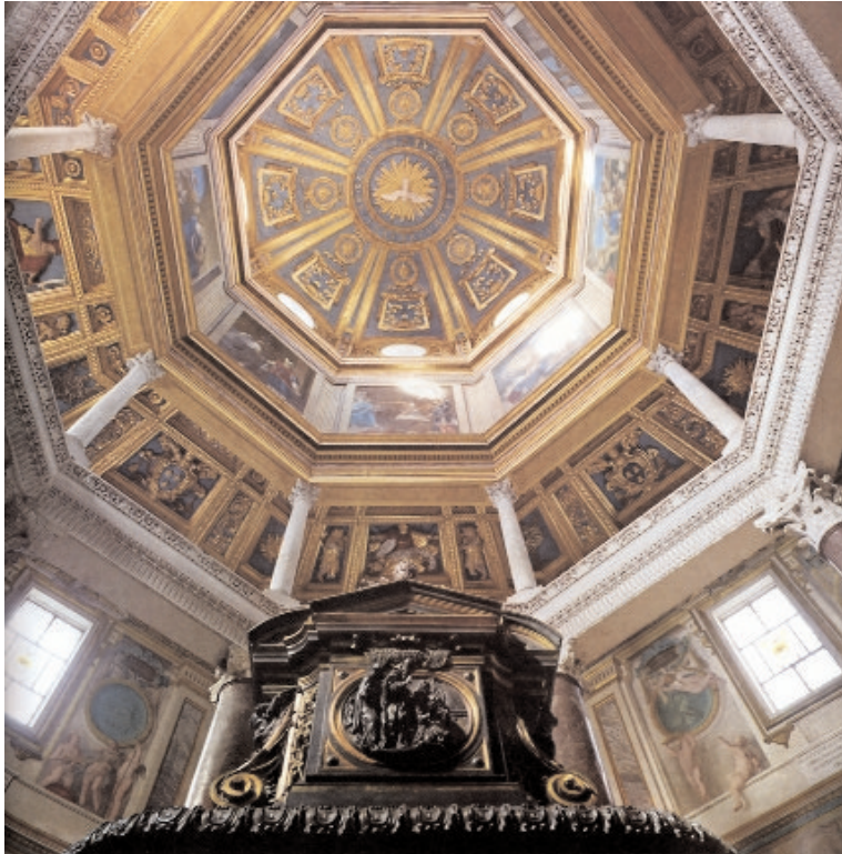
The dome of the Baptistery.

labors fruitful; but, as we know, spreading the message of salvation often meant risking their lives or enduring serious persecution. Despite all this, the early Christians were not stopped by the obstacles. When St Peter and St John had been warned by the authorities to keep quiet, they had replied, "We cannot but speak of what we have seen and heard!" 2 These words seem to ring out again and again, in the attitudes and deeds of the early Christians.