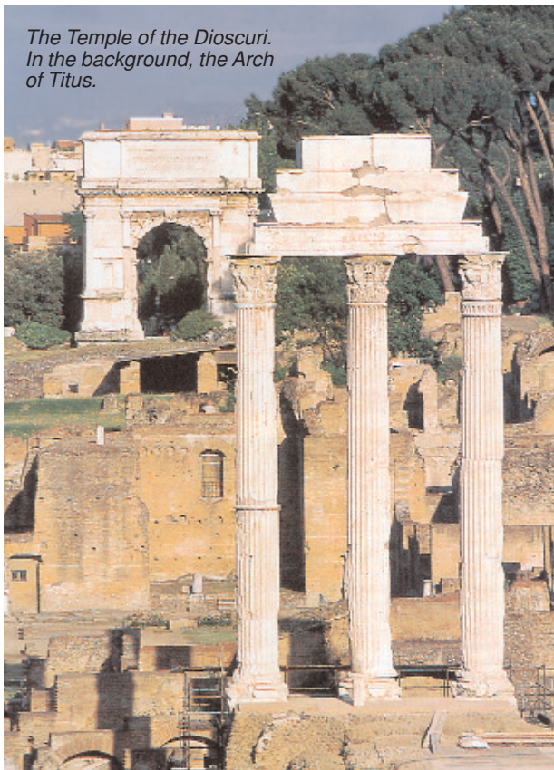
The Temple of the Dioscuri. In the background, the Arch of Titus.

Public opinion generally, in those times, shared in the same intolerance towards the followers of Christ. At the very least, Christians were thought to be "odd" people. Given that they helped their neighbor, were faithful to their spouses, paid their taxes, and scrupulously avoided any dishonesty in business, the reason for this was their fanatical devotion to their