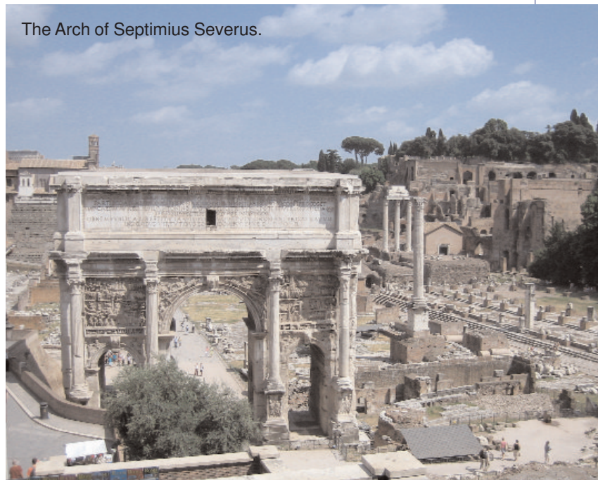
The Arch of Septimius Severus.

The Forum was adorned with many monuments and statues, and especially by pillars such as that of Trajan, and the various triumphal arches in honor of Titus, Septimius Severus, Constantine, and others. These were carved with depictions of each emperor's victorious military campaigns, to commemorate his moments of glory for future generations, following the