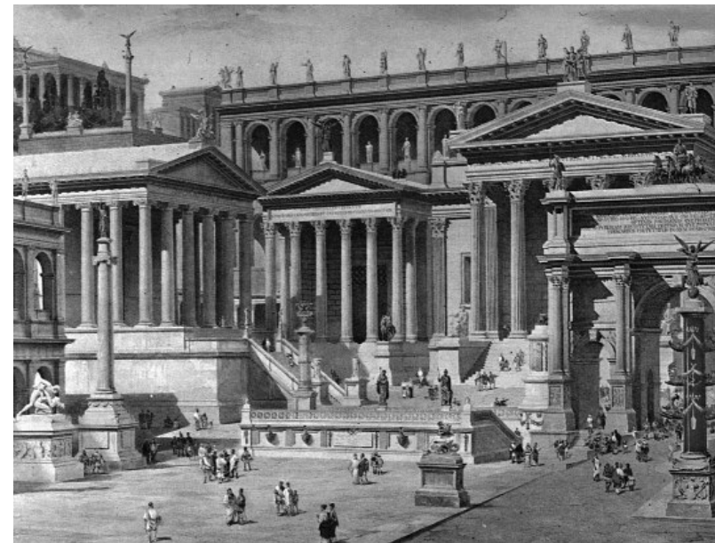
A reconstruction of the Roman Forum. In the center, almost at ground level, the Rostra, from which orators addressed the populace.

Most imposing of the civic buildings were the majestic basilicas, used for legal trials and commercial transactions. The vast spaces inside these buildings were divided into long naves and aisles by lines of