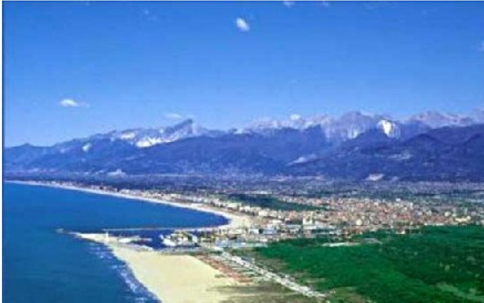
They stopped for lunch at Viareggio.